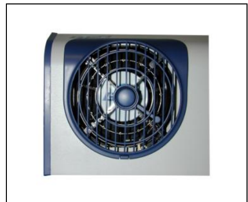
Removable fan guard with safety switch and point cleaner.